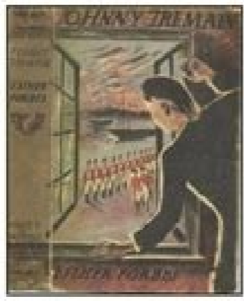
First edition, London, 1943 - fair use